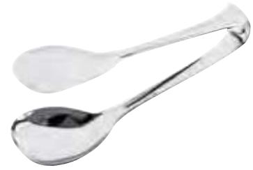
Fruit tongs Molla per frutta Obstzange Pince à fruits Pinza frutas

52550-53 18-10 S/S 52750-53 Silverplated S/S 12 cm - 4 11/16 in.