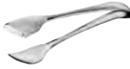
Sugar tongs Molla per zucchero Zuckerzange Pince à sucre Pinza azucar

52550-54 18-10 S/S 52750-54 Silverplated S/S 12,5 cm - 4 11/16 in.