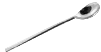
Ice tea spoon, set 6 pcs Cucchiaio bibita, Set 6 pezzi. Limonadenlöffel, 6 Stk. Cuiller à soda, 6 pieces Cuchara refresco, 6 piezas

52550 18-10 S/S 52750 Silverplated S/S -68 21 cm - 8 1/4 in. -69 26 cm - 10 1/4 in. -70 30 cm - 11 13/16 in.