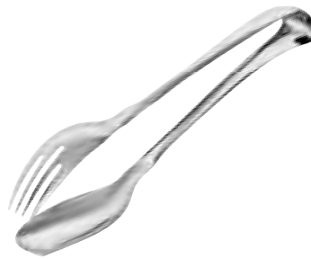
Vegetable / meat tongs Molla per carne e verdure Gemüse-/Fleischzange Pince à rôtir Pinza asados y verduras

52550-58 18-10 S/S 52750-58 Silverplated S/S 30 cm - 11 13/16 in.