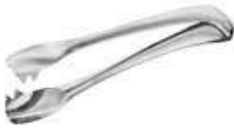
Sugar tongs Molla per zucchero Zuckerzange Pince à sucre Pinza azucar

52550-54 18-10 S/S 52750-54 Silverplated S/S 12,5 cm - 4 11/16 in.