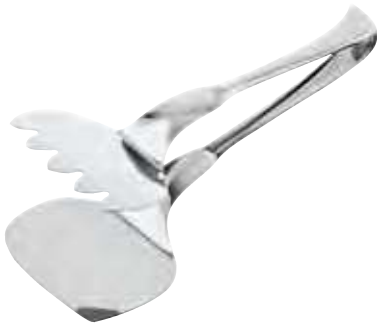
Multipurpose tongs Molla universale Universalszange Pince universelle Pinza universal

52550-50 18-10 S/S 52750-50 Silverplated S/S 23,5 cm - 9 3/4 in.