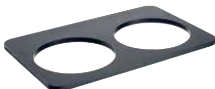
Bowl holder, 2 holes Pianetto portaciottole, 2 posti Schalenhalter 2 Plätze Etagère à 2 bols Soporte para 2 bols

h 1,5 cm 35 x 85 cm - h 5/8 in. 13 3/4 x 33 1/2 in.