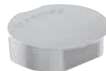
Lid for juice pitcher Coperchio brocca Saftkannendeckel Couvercle à carafe Tapa para jarra