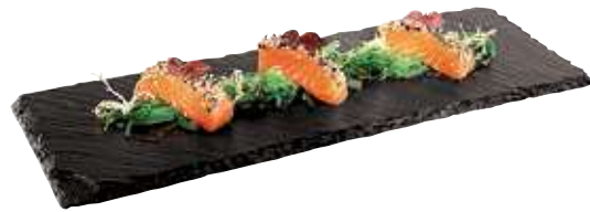
Natural slate tray Vassoio ardesia naturale Naturschieferplatte Plateau ardoise naturelle Bandeja de pizarra natural

Ø 7 cm - h 8 cm - 220 ml Ø 2 7/8 - h 3 1/8 - 0,23 Qts