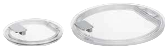
Airtight cover Coperchio ermetico Frischhaltedeckel Couvercle hermétique Tapa hermética

Ø 23 cm h 10,5 cm 2,5 lt Ø 9 in. h 4 1 / 8 in. 2,64 Qts