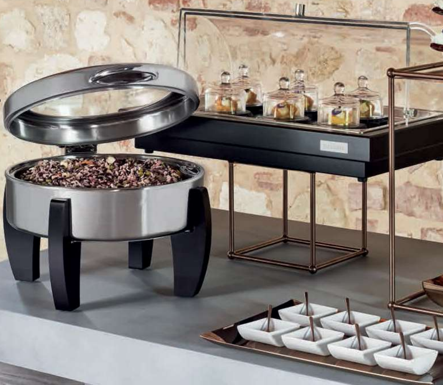
CHAFING DISH & COOL SHOWCASE ITALIAN BUFFET SAMBONET. BUFFET OPERA SAMBONET IN ROSE GOLD DIAMOND FINISH. HOLLOWARE LINEA Q SAMBONET IN PVD RUM FINISH. PORCELAIN ACCENTI ROSENTHAL.