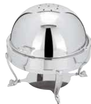
Asia Chafing dish, round

Equipped with stainless steel food pan GN 1/1 height 10 cm # 14102-10 Dotazione bacinella inox GN 1/1 altezza 10 cm # 14102-10