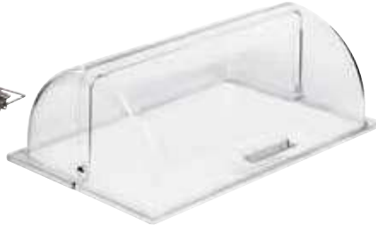
GN roll-top cover Coperchio GN roll-top GN-Rolltophaube Couvercle roll-top, GN Tapa roll-top, GN

For table stands Per i supporti: # 58489-02 - 58489-03