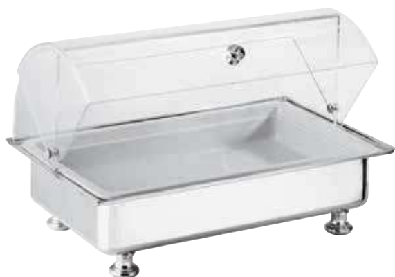
Cooled buffet showcase Vetrina refrigerata Buffet-kühl-vitrine Vitrine réfrigérée Vitrina buffet refrigerada

58436-60 18-10 S/S 57436-60 Silverplated S/S