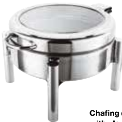
Chafing dish, round with glass

58166U40 18-10 S/S 57166U40 Silverplated S/S