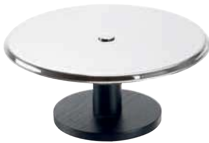
Cake stand Alzata torta Kuchenständer Support à tarte Pedestal para tartas

58488-28 Ø 28 cm - h 12 cm - 11 in. - 4 3 / 4 in. 58488-38 Ø 38 cm - h 12 cm - 15 in. - 4 3 / 4 in. 58488-78 Ø 28 cm - h 17 cm - 11 in. - 6 5 / 8 in. 58488-88 Ø 38 cm - h 17 cm - 15 in. - 6 5 / 8 in.