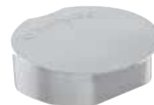
Lid for juice pitcher Coperchio brocca Saftkrugdeckel Couvercle à carafe Tapa para jarra