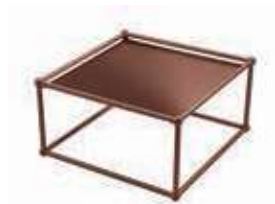
Element D Element D Element D Élément D Elemento D