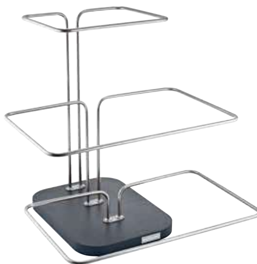
Table stand 3 tiers Supporto 3 livelli Tischständer, 3-Stufig Support de table 3 étages Soporte de mesa 3 niveles

Overall sizes / ingombro h 58 cm - 54 x 33 cm h 22 3 / 4 in. - 21 1 / 4 x 13 in.