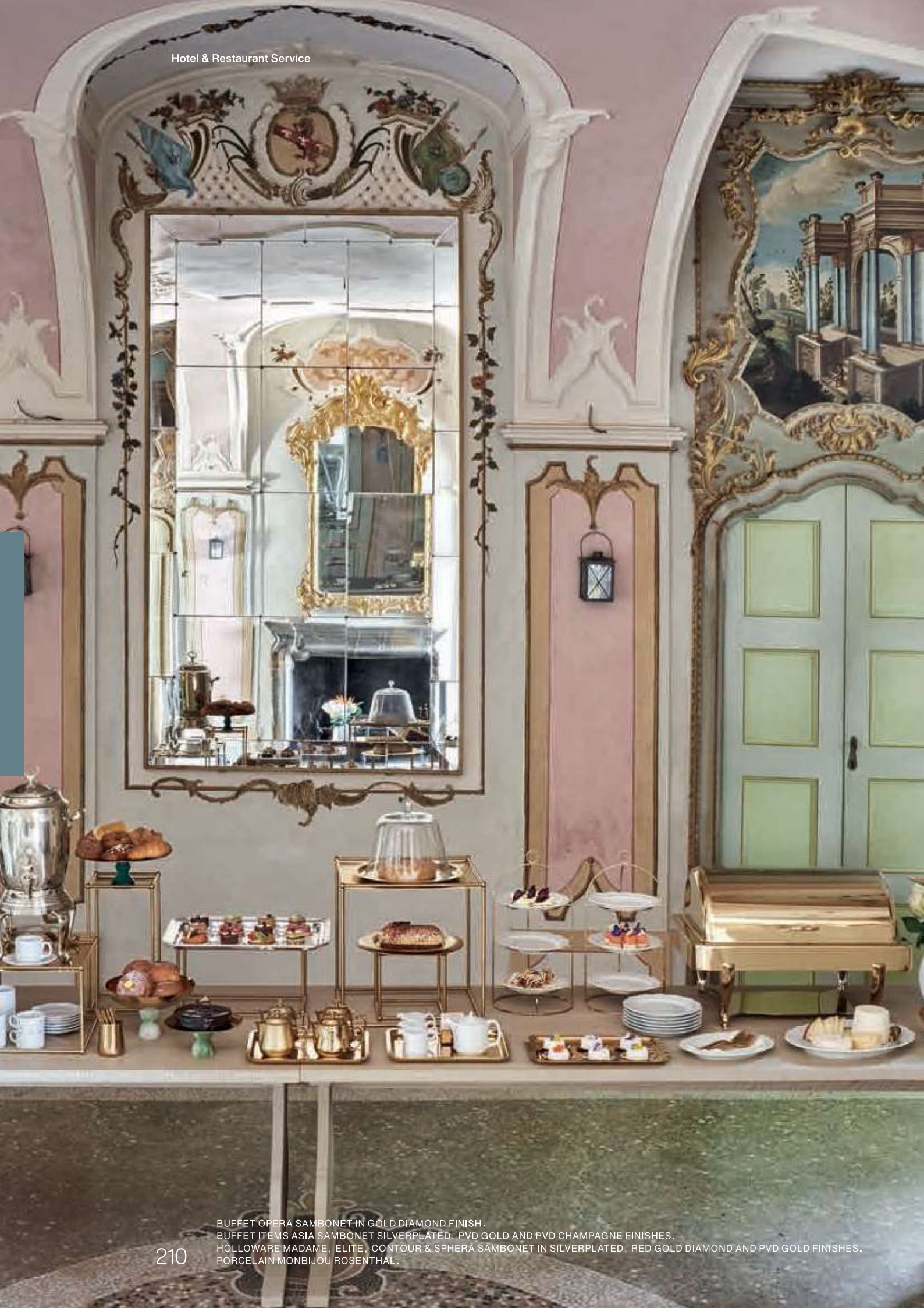
BUFFET OPERA SAMBONET IN GOLD DIAMOND FINISH. BUFFET ITEMS ASIA SAMBONET SILVERPLATED. PVD GOLD AND PVD CHAMPAGNE FINISHES. HOLLOWARE MADAME, ELITE, CONTOUR & SPHERA SAMBONET IN SILVERPLATED, RED GOLD DIAMOND AND PVD GOLD FINISHES. PORCELAIN MONBIJOU ROSENTHAL.