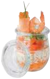
Glasses with lid, 12 pcs Vasetti con coperchio, 12 pz Gläser mit Deckel, 12-tlg Verrines avec couvercle, 12 pcs Tarros de vidrio con tapa, 12 pz