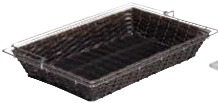
Bread basket Cesto pane Brot-Korb Corbeille à pain Cesta pan