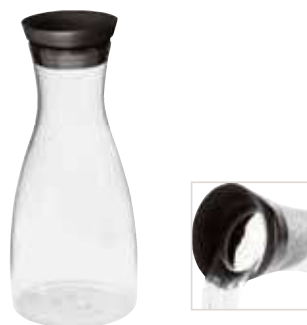
Juice pitcher Caraffa Saftkanne Carafe à jus de fruits Jarra zumo

Spout opens and closes automatically. Chromed foot with cooler, keeps drinks chilled up to 4 hours. Tappo apri/chiudi automatico. Base cromata con eutettico. Mantiene le bevande refrigerate fino a 4 ore.