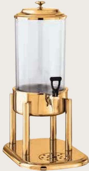
Juice dispenser Distributore succhi Saftspender Distributeur à jus Dispensador de zumo