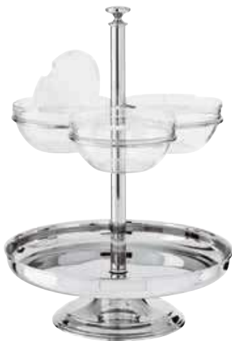
Swivelling stand Alzata girevole Büffetständer drehbar Présentoir tournant Expositor giratorio