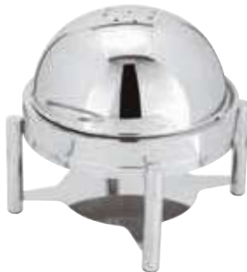
Chafing dish, round Ø 33

Ø 33 cm - h 47 cm - 3,5 L - 10,5 kg. Ø 13 in. - h 18½ in. - 3,7 qts - 23,30 lbs