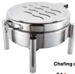
Chafing dish, round