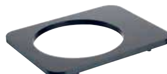
Bowl holder Pianetto portaciottole Schalenhalter Etagère à bol Soporte para bol