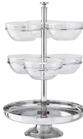
Swivelling stand Alzata girevole Büffetständer drehbar Présentoir tournant Expositor giratorio

* Equipped with 3 glass bowls and polycarbonate hermetic lids Dotazione 3 ciotole vetro con coperchi ermetici in polycarbonato