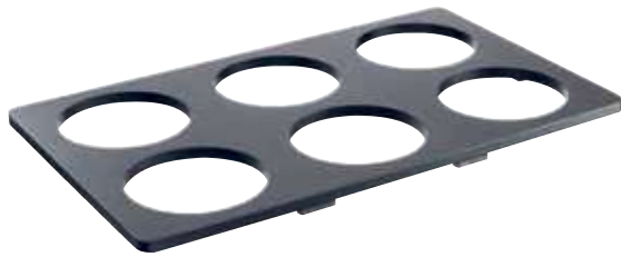
Insert for 6 bowls Inserto vetrina per 6 ciotole Modul für 6 Schüssel Module pour 6 bols Módulo para 6 bols

58489-06 53 x 32 cm - 20 7 / 8 x 12 5 / 8 in.