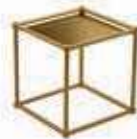
Element E Element E Element E Élément E Elemento E

31 x 31 H 16 cm 12 1 / 4 x 12 1 / 4 in. H 6 1 / 4 in.