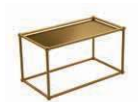
Element G Element G Element G Élément G Elemento G