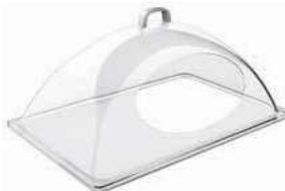
GN cover Coperchio GN GN-Kuppelhaube Couvercle GN Campana GN

-12 GN 1/2 - h 6,5 cm - 2½ in. -11 GN 1/1 - h 6,5 cm - 2½ in.