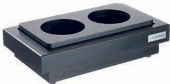
2 Cereal / juice pitcher-bar Espositore per 2 brocche acqua / cereali Saft- / Cerealienkannen-Bar Présentoir 2 carafes à céréales / jus Expositor 2 jarras zumo / cereales