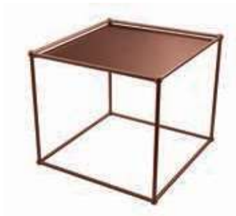
Element B Element B Element B Élément B Elemento B

43 x 43 cm H 43 cm 16 7 / 8 x 16 7 / 8 in. H 16 7 / 8 in.