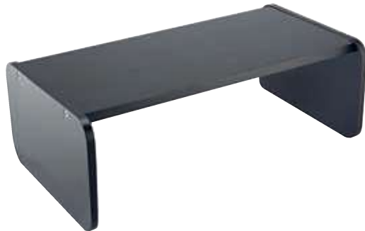
Riser Alzata Buffet-Ständer Support Soporte

58484-10 h 15 cm - 59,5 x 33,5 cm - h 5 7 / 8 in. - 23 3 / 8 x 13 1 / 8 58484-11 h 27 cm - 62,5 x 33,5 cm - h 10 5 / 8 in. - 24 5 / 8 x 13 1 / 8 in.