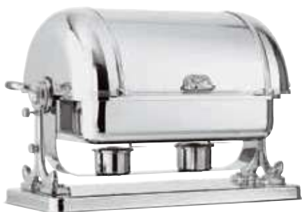
America Chafing dish GN 1/1

78 x 48,5 cm - h 48 cm - 24,5 kg. c.ca 30 3/4 x 19 in. - h 18 7/8 in. - 54,4 lbs. approx.