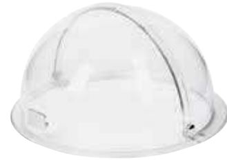
Round roll-top lid Coperchio roll-top tondo Rolltophaube Couvercle roll-top Campana roll-top

42461-35 Ø 35 cm h. 20 cm Ø 13¾ in. h. 7⅞ in.