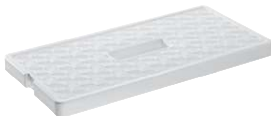
Eutectic pad Piastra refrigerante Kühlakku Cartouche eutectique Placa refrigerante

Spout opens and closes automatically. Tappo apri/chiudi automatico.