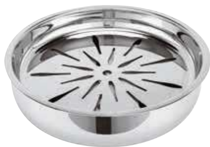
Cooled yogurt dispenser Porta yogurt refrigerato Joghurt-Kühlschale Rafraîchissoir à yogurt Enfriador para yogurt