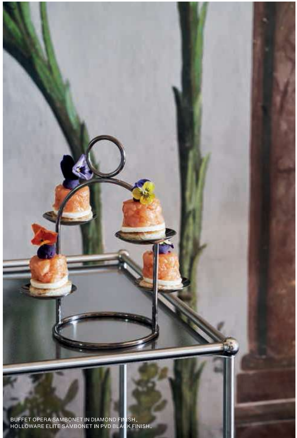
BUFFET OPERA SAMBONET IN DIAMOND FINISH. HOLLOWARE ELITE SAMBONET IN PVD BLACK FINISH.