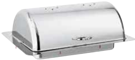
Asia Chafing dish, rectangular gn 1/1

67,2 x 44 cm - h. 34,5 cm - 12,2 kg. c.ca 26 1/2 x 17 3/8 in. - h 13 5/8 in. - 27,10 lbs. approx.