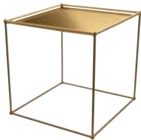
Element A Element A Element A Élément A Elemento A