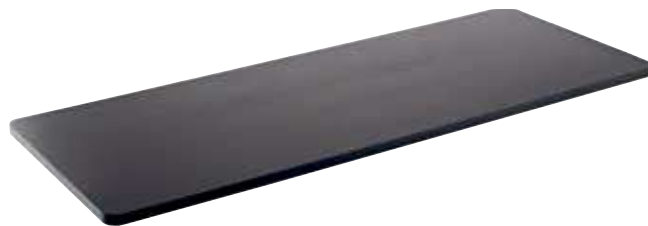
Shelf Ripiano Regal Etagère Estante

-DA h 0,6 cm 35 x 35 cm - h 1/4 in. 13 3/4 x 13 3/4 in. -DB h 0,6 cm 35 x 85 cm - h 1/4 in. 13 3/4 x 33 1/2 in.