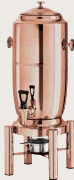
Coffee dispenser Scaldacaffè Kaffeespender Réchaud à café Calentador de café

Equipped with 1 eutectic pad # 58333-VA Dotazione 1 contenitore eutettico # 58333-VA