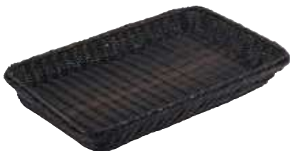
Bread basket Cesto pane Brot-Korb Corbeille à pain Cesta pan

42461-11 Bread basket / Cesto pane 42452-53 GN roll-top cover / Coperchio GN roll-top