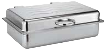
Chafing dish, rectangular

57 x 47 cm • h 17,5 cm • 10 L 22 7 / 16 x 18 1 / 2 in. • h 6 7 / 8 in. • 2,65 gal.