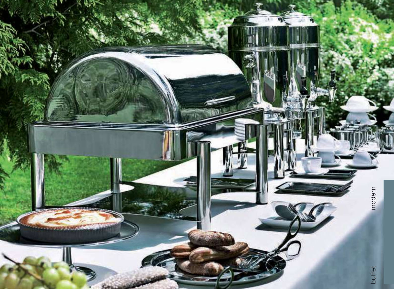
CHAFING DISH ASIA 2000 SAMBONET. HOLLOWARE ELITE SAMBONET. CUTLERY LIVING SAMBONET.