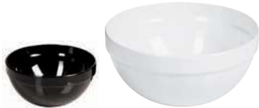
Round bowl Ciotola tonda Schüssel, rund Bol ronde Bol redondo

58485-AA 53 x 32 cm - 20 7 / 8 x 12 5 / 8 in.