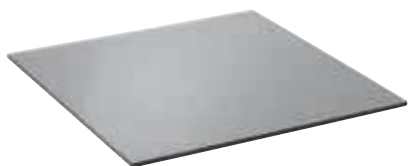
Shelf Ripiano Regal Etagère Estante