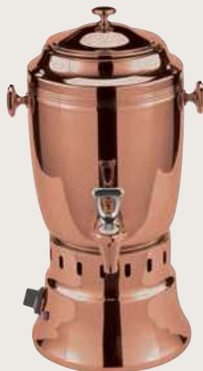
Coffee dispenser Scaldacaffè Kaffeespender Réchaud à café Calentador de café