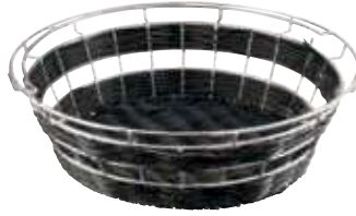
Bread basket Cesto pane Brotkorb Corbeille à pain Cesta pan

42461-35 Ø 35 cm h. 20 cm Ø 13¾ in. h. 7⅞ in.