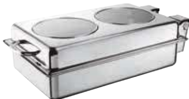
Chafing dish, rectangular with glass

68,5 x 35,5 cm • h. 17,5 cm • 10 L 26 15 / 16 x 14 in. • h 6 7 / 8 in. • 2,65 gal.