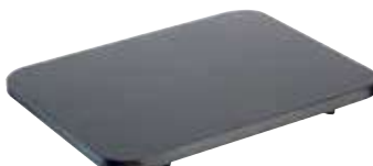
Plain shelf Pianetto liscio Regal Glatt Etagère Estante liso