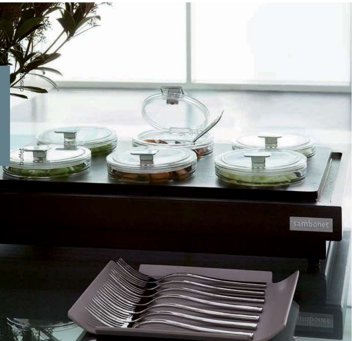
COOL SHOWCASE ITALIAN BUFFET SAMBONET GLASS BOWLS WITH AIRTIGHT COVER TRAY LINEA Q BAMBOO FIBER SAMBONET FLATWARE LINEA Q SAMBONET