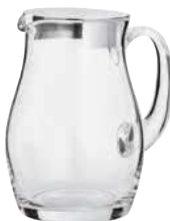
Juice pitcher with lid Brocca con coperchio Saftkanne mit Deckel Carafe avec couvercle Jarra con tapa

* Equipped with 6 glass bowls and polycarbonate hermetic lids Dotazione 3 ciotole vetro con coperchi ermetici in policarbonato