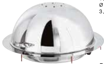
Asia Chafing dish, round

67,2 x 44 cm - h. 34,5 cm - 12,2 kg. c.ca 26 1/2 x 17 3/8 in. - h 13 5/8 in. - 27,10 lbs. approx.