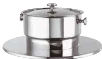
Soup tureen with cover and adapter Zuppiera con coperchio e adattatore Suppenterrine mit Deckel und Einsatzring Petite marmite avec couvercle et adaptateur Olla baño-maria a sopa con tapa y anillo adaptador

58136-GA 18-10 S/S 57136-GA Silverplated S/S