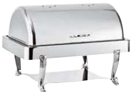
Asia Chafing dish, rectangular GN 1/1

Equipped with stainless steel food pan GN 1/1 height 10 cm # 14102-10 Dotazione bacinella inox GN 1/1 altezza 10 cm # 14102-10