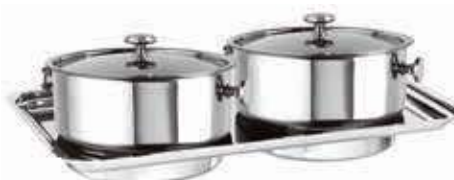
Soup tureens with covers and adapter Set 2 zuppiera con coperchi e adattatore 2 Suppentöpfe mit Deckel und Einsatzplatte Ensemble 2 soupières avec couvercles et adaptateur 2 ollas baño-maria a sopa con tapas y anillo adaptador

* Matching all round chafing dishes Ø 13 in. Adatta a tutti gli scaldavivande tondi Ø 33 cm