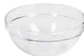
Bowl Ciotola Schale Bol Copa