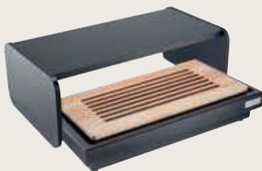
COMPOSED BY COMPOSTA DA

58484-10 Riser / Alzata 58485-00 Cool showcase / Base vetrina 58485-AA Cutting board / Tagliere