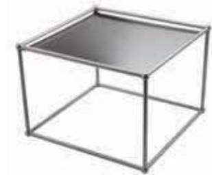
Element C Element C Element C Élément C Elemento C

39 x 39 cm H 34 cm 15 3 / 8 x 15 3 / 8 in. H 13 3 / 8 in.