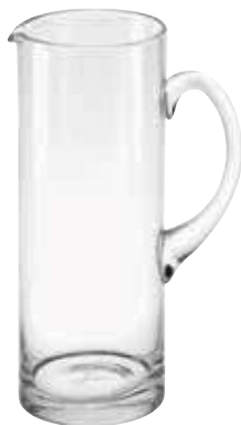
Pitcher Brocca Kanne Carafe Jarra