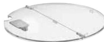
Cover Coperchio Deckel Couvercle Tapa

-23 Ø 23 cm - 9 in. -14 Ø 14,5 cm - 5 3 / 4 in.