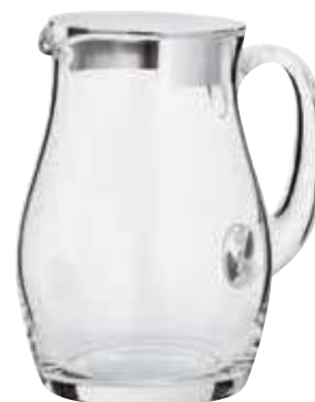
Juice pitcher with lid Brocca con coperchio Saftkrug mit Deckel Carafe avec couvercle Jarra con tapa

58401-EO 18-10 S/S 57401-EO Silverplated S/S