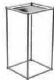
Element F Element F Element F Élément F Elemento F

21 x 21 H 21 cm 8 1 / 4 x 8 1 / 4 in. H 8 1 / 4 in.