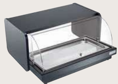
COMPOSED BY COMPOSTA DA

58484-03 Bowl riser / Alzata portaciotole 42452-14 Airtight cover / Coperchio ermetico 3X 44837-05 Round bowl / Ciotola tonda 3X