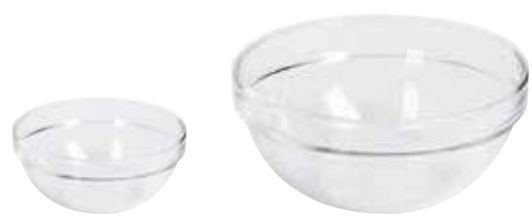
Round bowl Ciotola tonda Schüssel, rund Bol ronde Bol redondo

B25 Ø 23 cm h 10,5 cm 2,5 lt - Ø 9 in. h 4 1 / 8 in. 2,64 Qts B05 Ø 14 cm h 6,5 cm 0,5 lt - Ø 5 1 / 2 in. h 2 1 / 2 in. 0,52 Qts