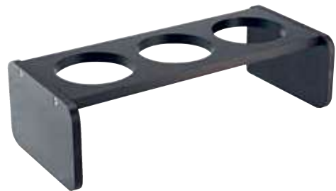
Bowl riser Alzata portaciotole Schüssel-Buffet-Ständer Support à bols Soporte para bols

58484-10 h 15 cm - 59,5 x 33,5 cm - h 5 7 / 8 in. - 23 3 / 8 x 13 1 / 8 58484-11 h 27 cm - 62,5 x 33,5 cm - h 10 5 / 8 in. - 24 5 / 8 x 13 1 / 8 in.