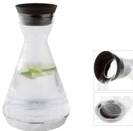
Juice pitcher Caraffa Saftkanne Carafe à jus de fruits Jarra zumo