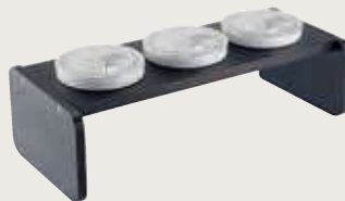
COMPOSED BY COMPOSTA DA

58484-10 Riser / Alzata 58485-00 Cool showcase / Base vetrina 58485-AA Cutting board / Tagliere