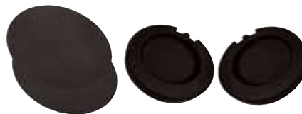
Eutectic pads, 2 pcs Contenitori eutettici, 2 pz Kühlakkus, 2-tlg Cartouches eutectiques, 2 pcs Acumuladores de frío, 2 pz

h 10 cm - 39 x 22 cm h 3 in. - 15 3 / 8 x 8 5 / 8 in.