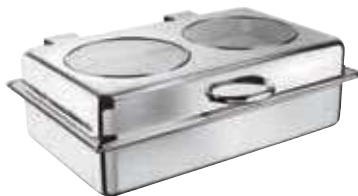
Chafing dish, rectangular with glass

58162U57 18-10 S/S 57162U57 Silverplated S/S