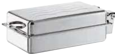
Chafing dish, rectangular

58162U55 18-10 S/S 57162U55 Silverplated S/S