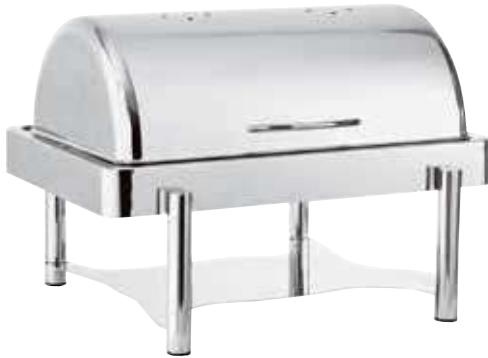
Chafing dish, rectangular GN 1/1

67,2 x 49 cm - h 44 cm - 16,5 Kg. c.ca 26½ x 19¼ in. - h 17¾ in. - 36,70 lbs. approx.