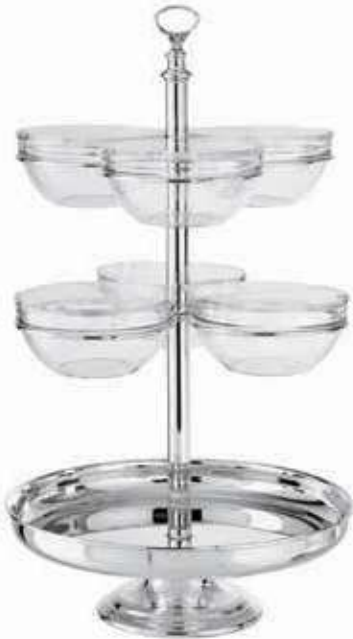
Swivelling stand Alzata girevole Büffetständer drehbar Présentoir tournant Expositor giratorio

57434-03 Silverplated S/S * 57434Z03 Silverplated S/S