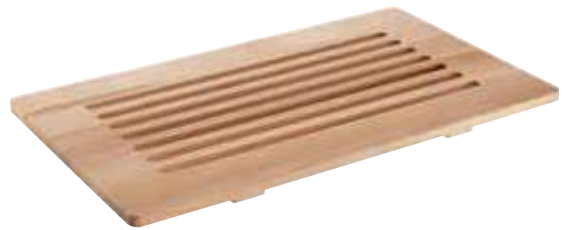
Cutting board Tagliere Tranchierbrett Planche à découper Plancha para cortar

For bowls per ciotole Ø 14 cm - Ø 5 1 / 2 in.