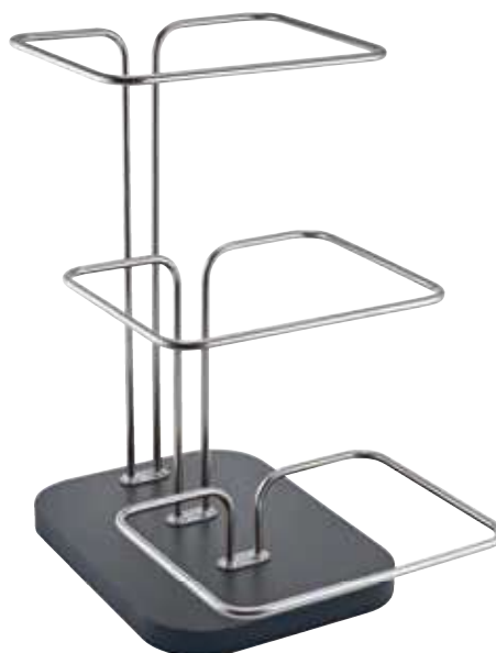
Table stand 3 tiers Supporto 3 livelli Tischständer, 3-Stufig Support de table 3 étages Soporte de mesa 3 niveles

Overall sizes / ingombro h 35,5 cm - 48 x 54 cm h 14 in. - 18 7 / 8 x 21 1 / 4 in.