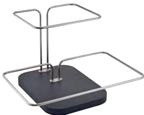
Table stand 2 tiers Supporto 2 livelli Tischständer, 2-Stufig Support de table 2 étages Soporte de mesa 2 niveles