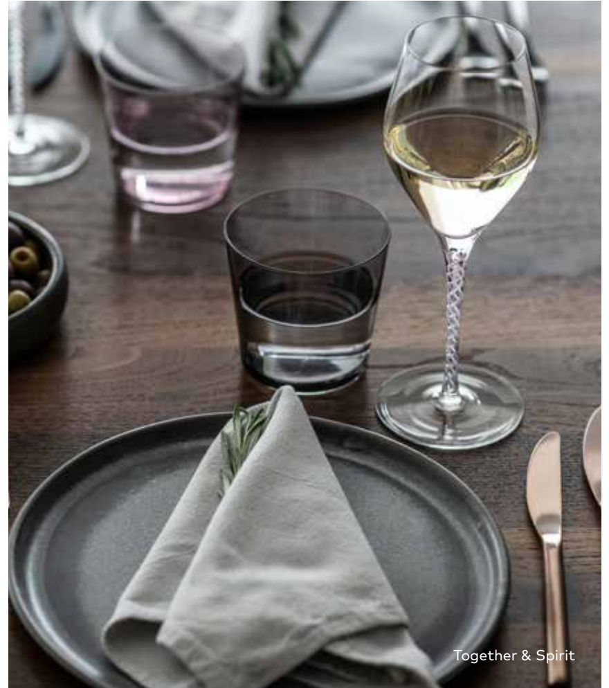
Together & Spirit