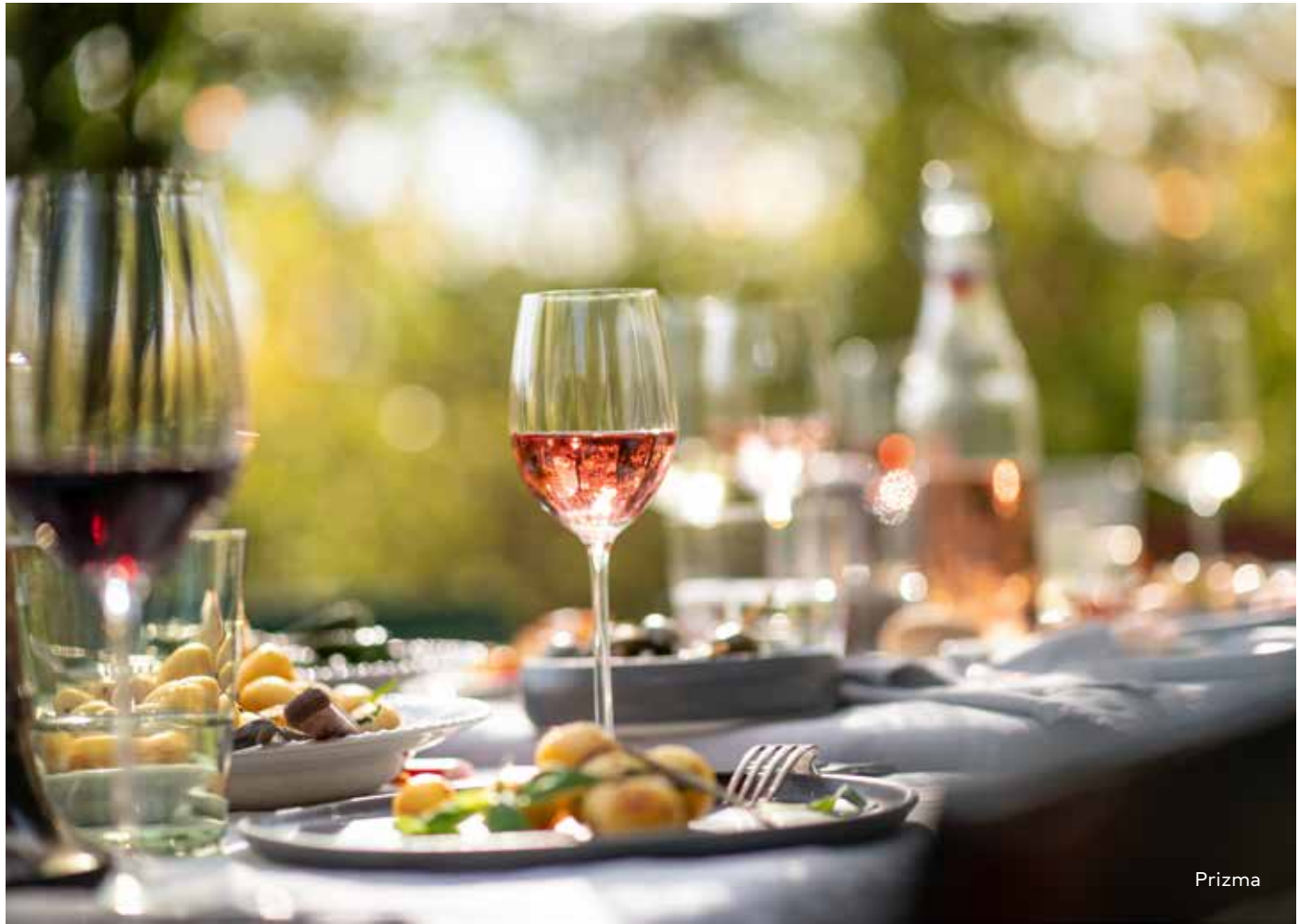
A perfect place to come together.