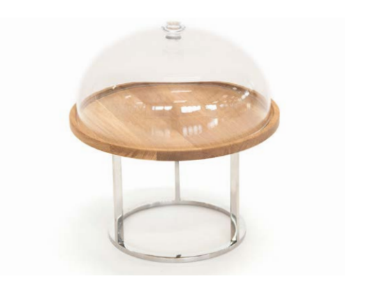
Compatible with Cloche BU_GC001 and Tilt Risers