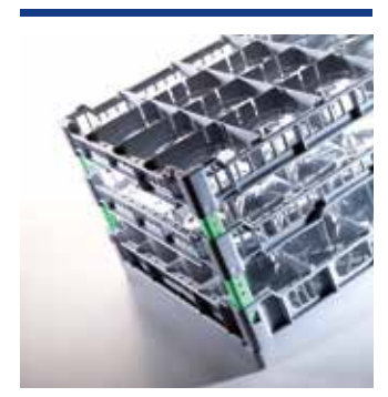
Rack systems 400 x 400 for smaller dishwashers in the under-counter area

Find out about the variety of our products.