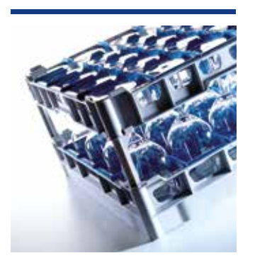
Rack systems 500 x 500 for the gastro field