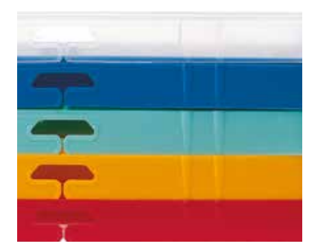
The lids are available in 5 different colours.