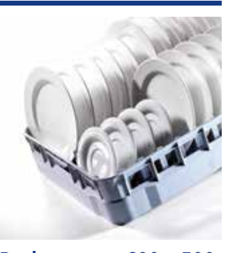
Rack systems 600 x 500 for large hooded and travelling rack dishwashers