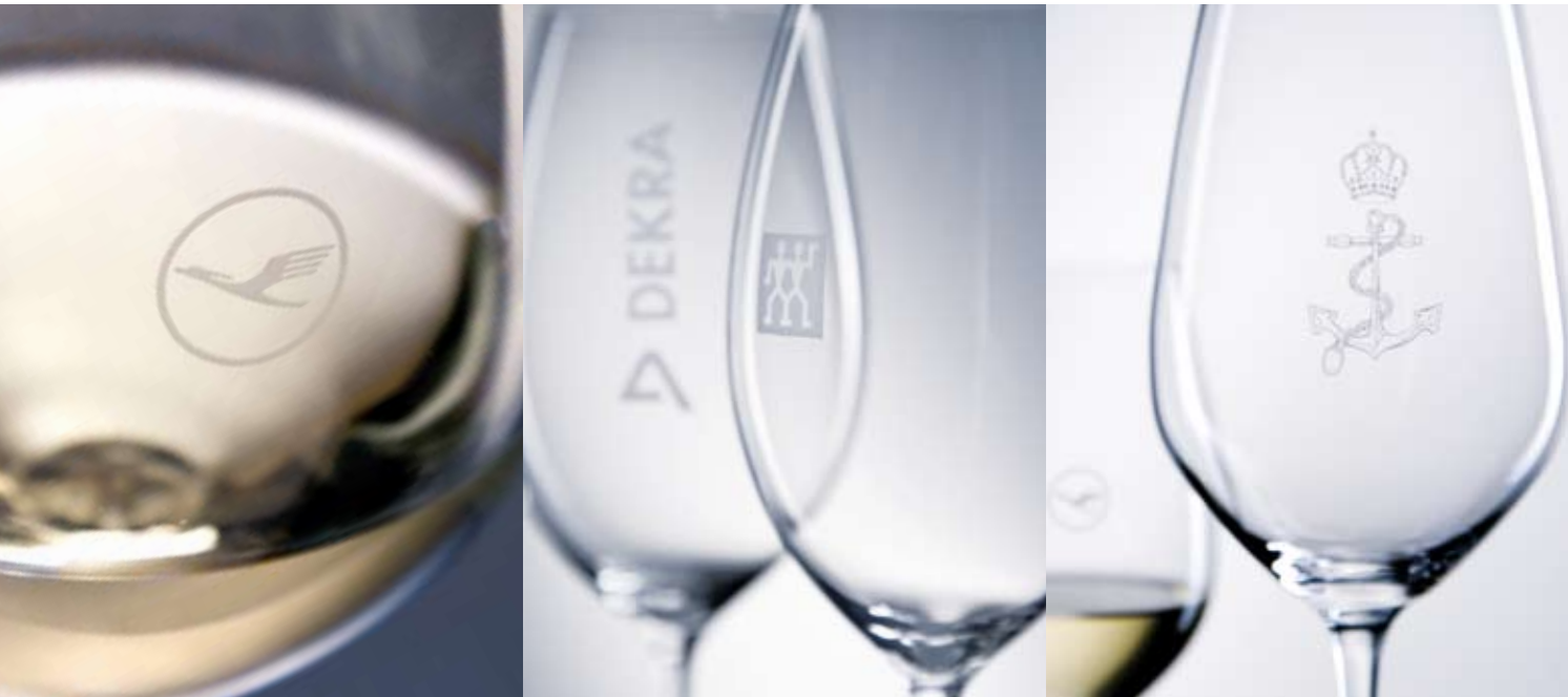
Obvious brand impact.