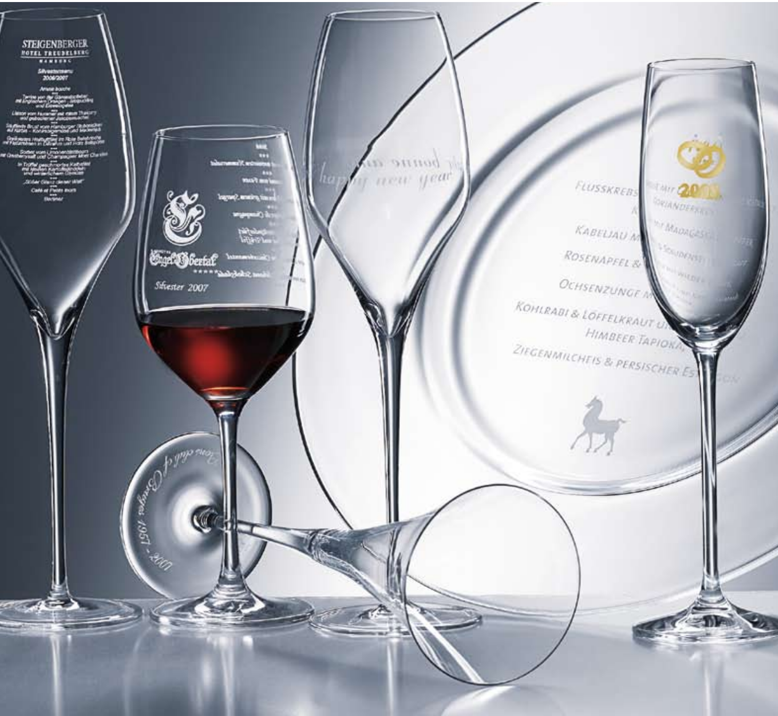
From menus to poetry: glassware with printed text for special occasions and events.