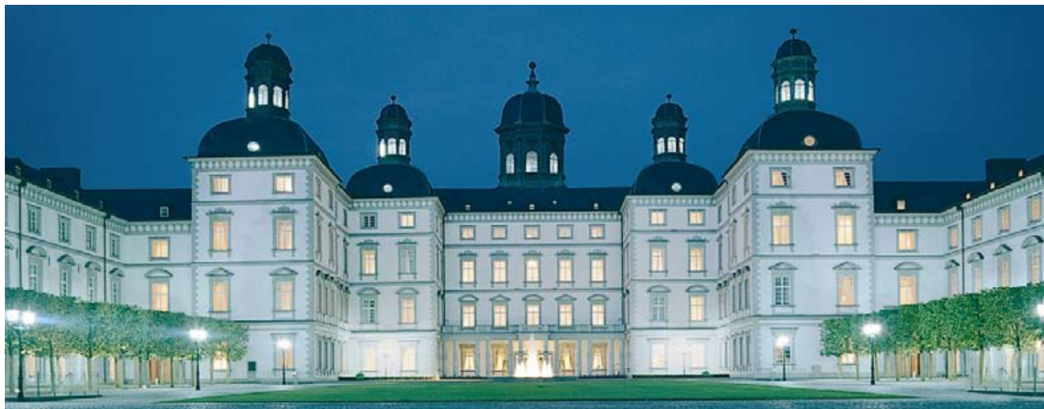
Grandhotel Schloss Bensberg, Bergisch Gladbach