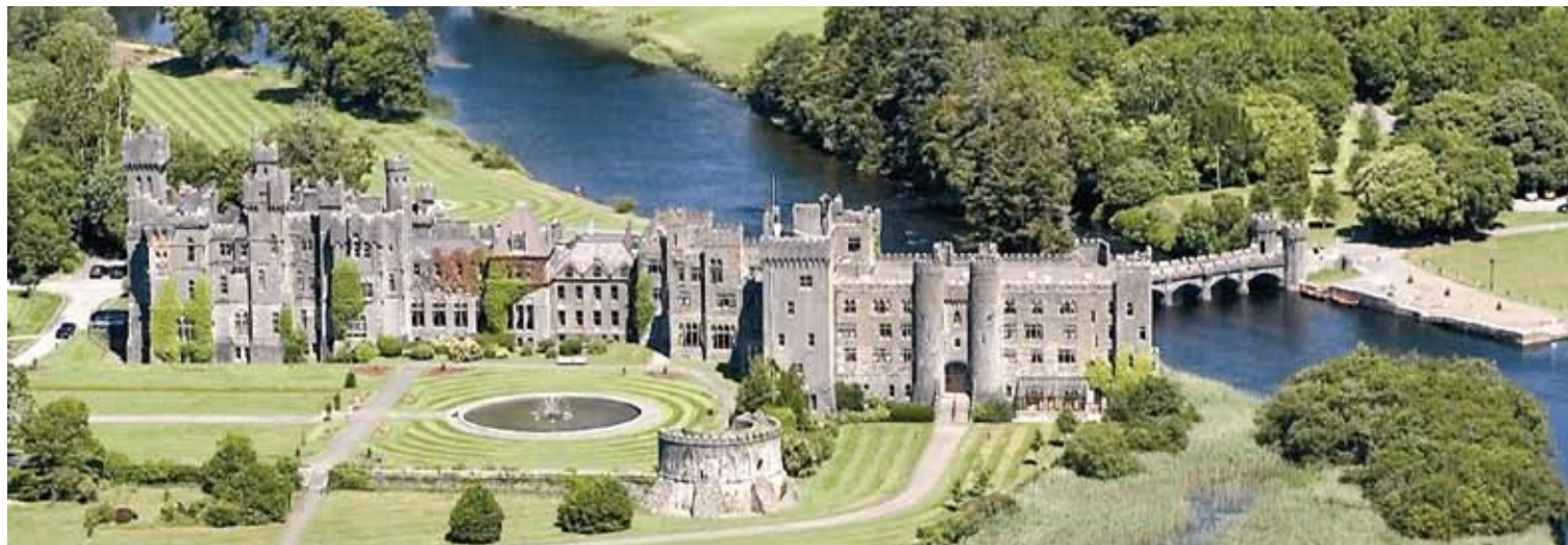
Ashford Castle, Cong, Ireland