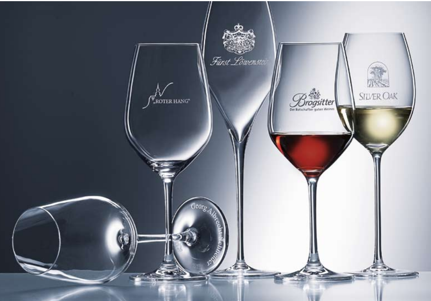
Logo and text printing for vineyards and wine dealers.