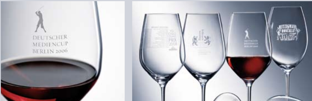
High value, high-quality mementos: printed glassware for events.