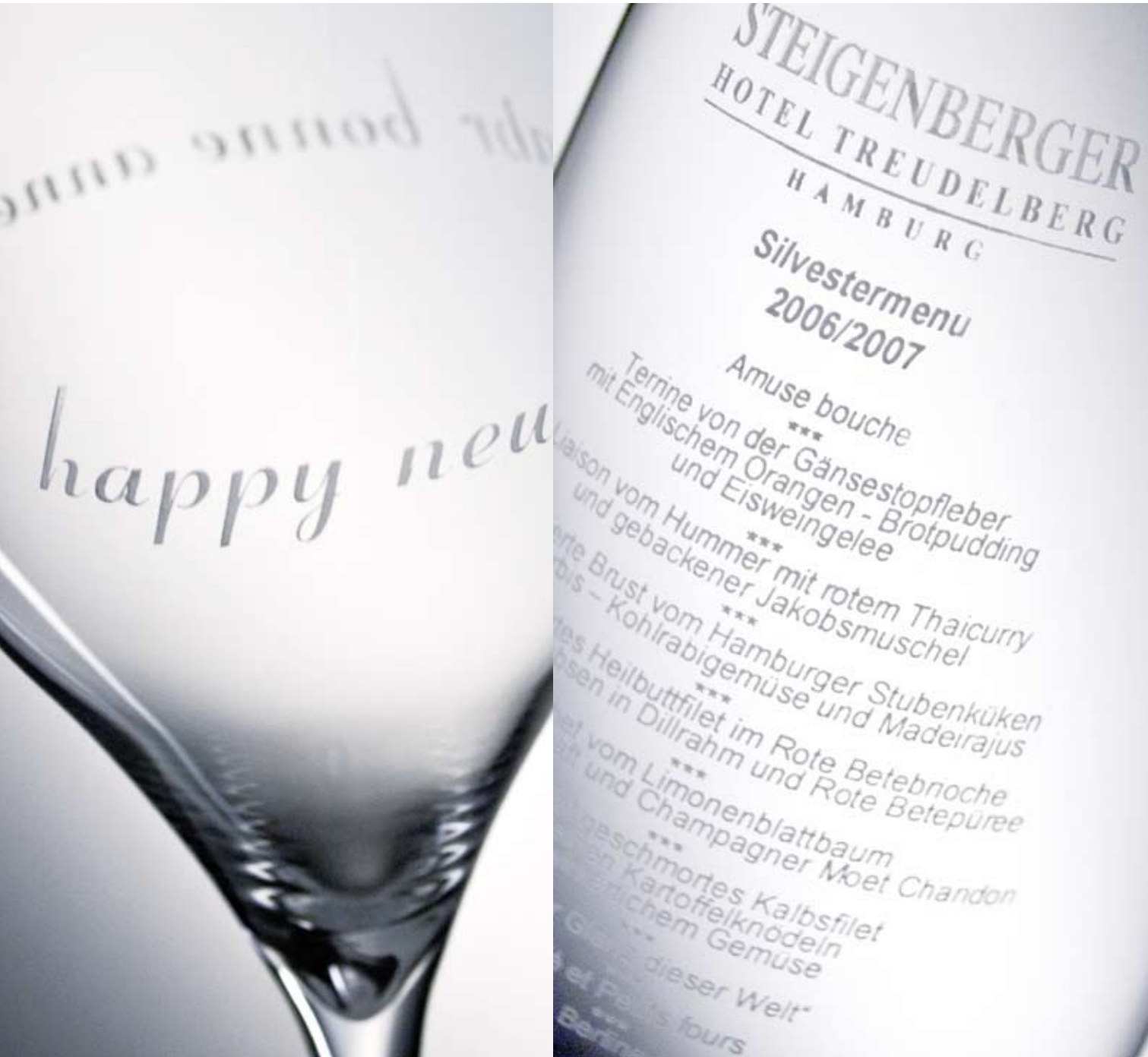
Typography to compliment the shape of a glass, can be used to create a sophisticated look.