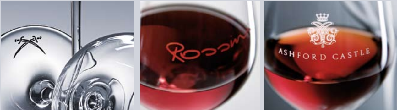
Striking, yet subtle: glasses for hotels, restaurants and events.